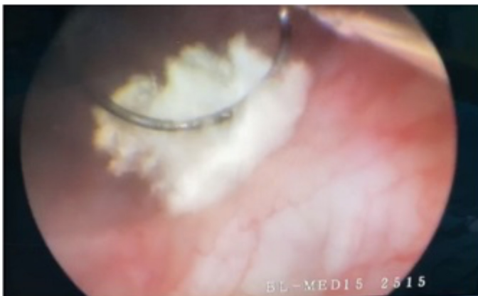
Figure 2. Cystoscopy reveals cotton-like appearance on the floor and right wall of bladder

by the urachus anomaly. As the patient had a urethral catheter for 6 months, chronic irritation of the catheter may have been in this case.